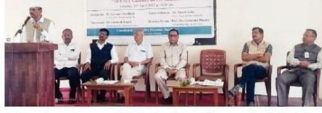
किसनवीर महाविद्यालय वाई येथे नेट सेट परीक्षा विषयी मान्यवरांनी मार्गदर्शन केले.