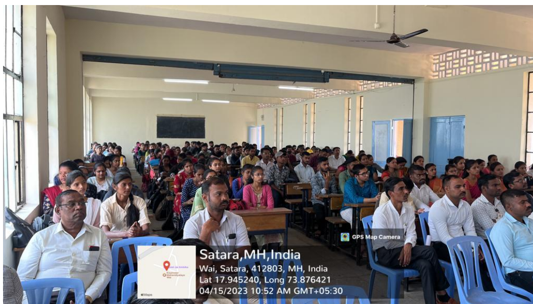
Audience at the Inaugural Ceremony